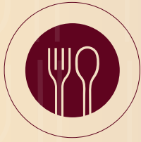
PLATE ABOVE CATERING