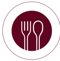
PLATE ABOVE CATERING