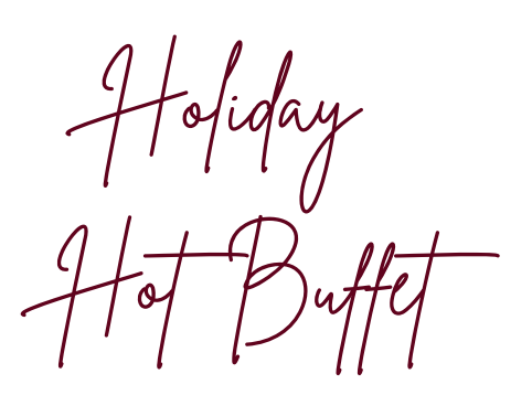
Minimum 25 guests. $34.95 per person | 24 % service fee and 6.5% tax (if applicable)